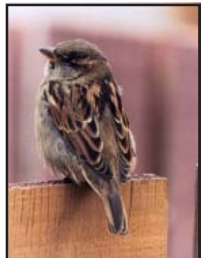
Amateur - Fauna "House Sparrow" Terry Conroy