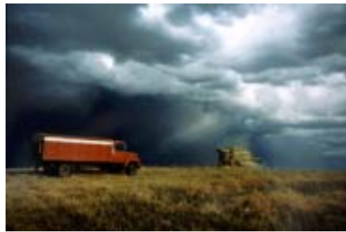
Cheryl Pady "Harvest Storm"