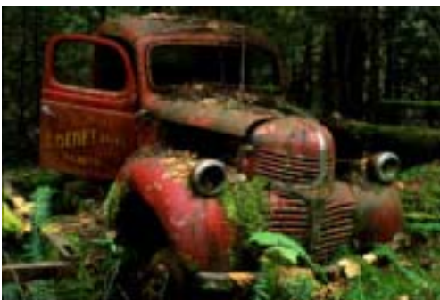
Larry Easton "Dodge Red"