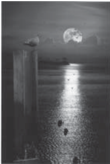
B & W - Open "Harbour View" Don Mathieson