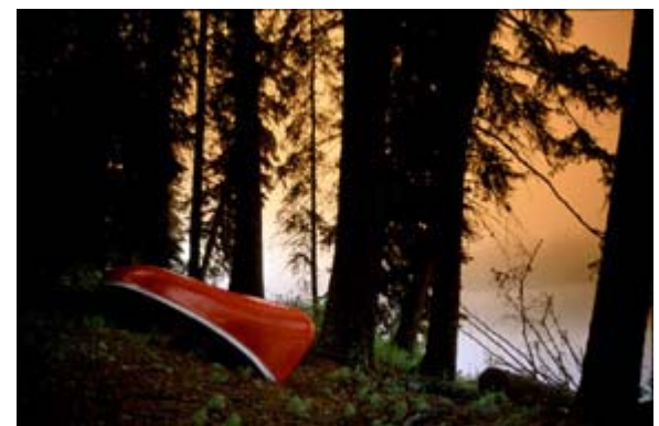
Transparency Battle 2003 Best of Show "Canoe" Wayne Iverson