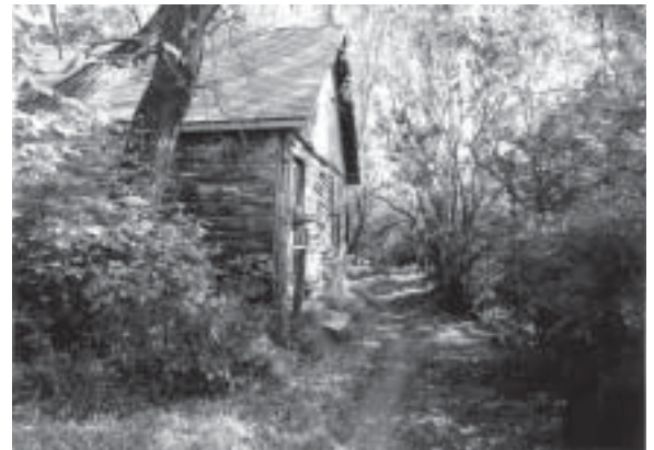
SaskAmateur 2003 Black & White Landscape 1st Place - "Path of the Past" Jim Russell