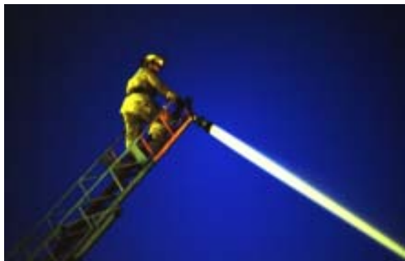
SaskAmateur 2003 Colour - People First Place - "Fire Fighters Night Vigil" Larry Easton