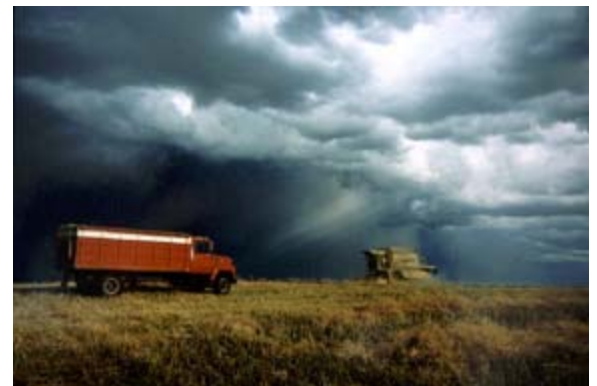
SaskAmateur 2003 Colour - Landscape First Place - "Harvest Storm" Cheryl Pady Transparency Battle 2003