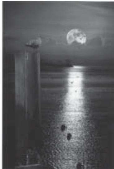
SaskAmateur 2003 Black & White Open 1st Place - "Harbour View" Don Mathieson