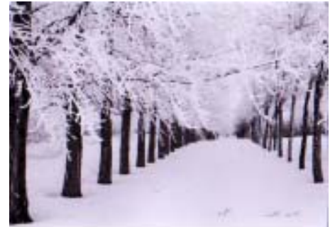
B & W: Scapes - Advanced Amateur "Winter Tree Line" Cheryl Pady