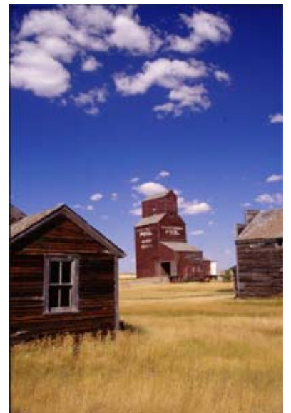
Honourable Mention "Once Upon a Time!" Murray Bryck