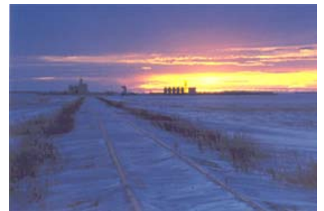
Slide: Scapes - Advanced Amateur "Prairie Solitude" Murray Bryck