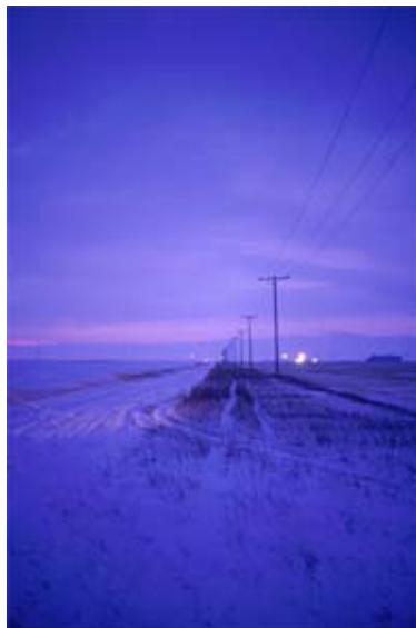
Slide: Scapes - Amateur "Parallel" Janice Krietemeyer