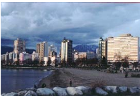
Colour: Scapes - Amateur "Evening, English Bay Beach" Rob Fisher